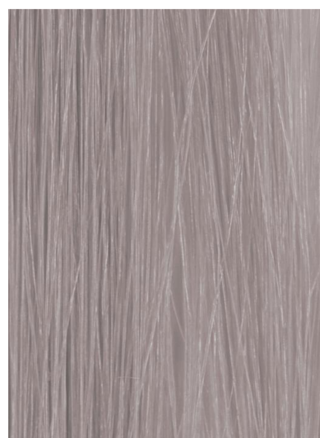
Platinum blonde Ice violet