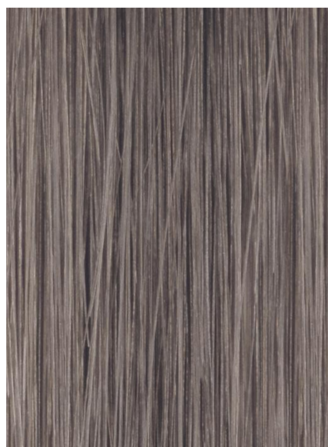
Blonde Ice violet